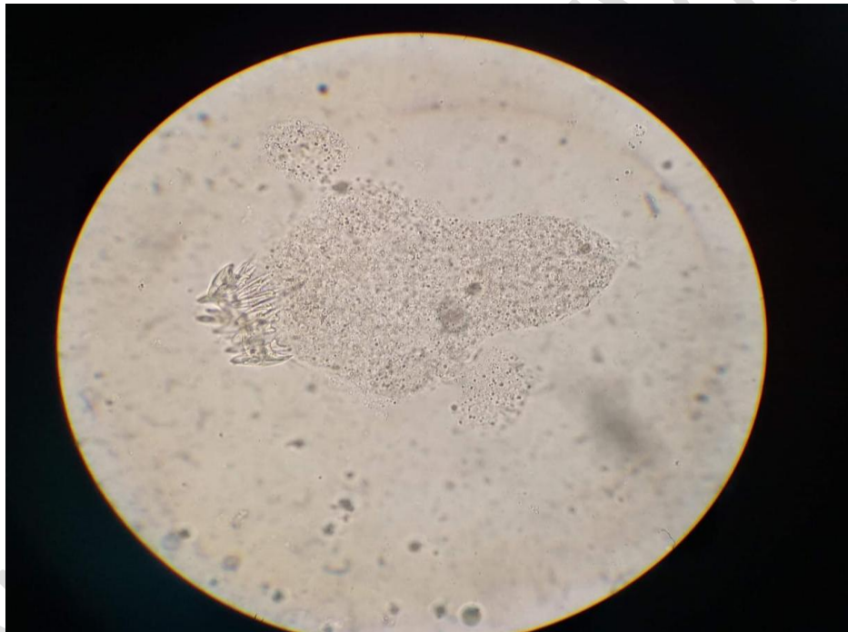
Figure 3. Wet mount of the pus was prepared and observed under the 10x followed by 40x objective lens of the microscope shows few pus cells and plenty of hooklets and scolices of Echinococcus granulosus

Figure 1 and 2 show a thick walled cystic lesion measuring 4x4 cm in the left frontal lobe which is subcalverial in location. The lesion is causing buckling of the underlying parenchyma. Mild perilesional edema is noted causing mass effect in the form of effacement of left frontal horn of lateral ventricle, left basal ganglia along with midline shift suggestive of Hydatid cyst.