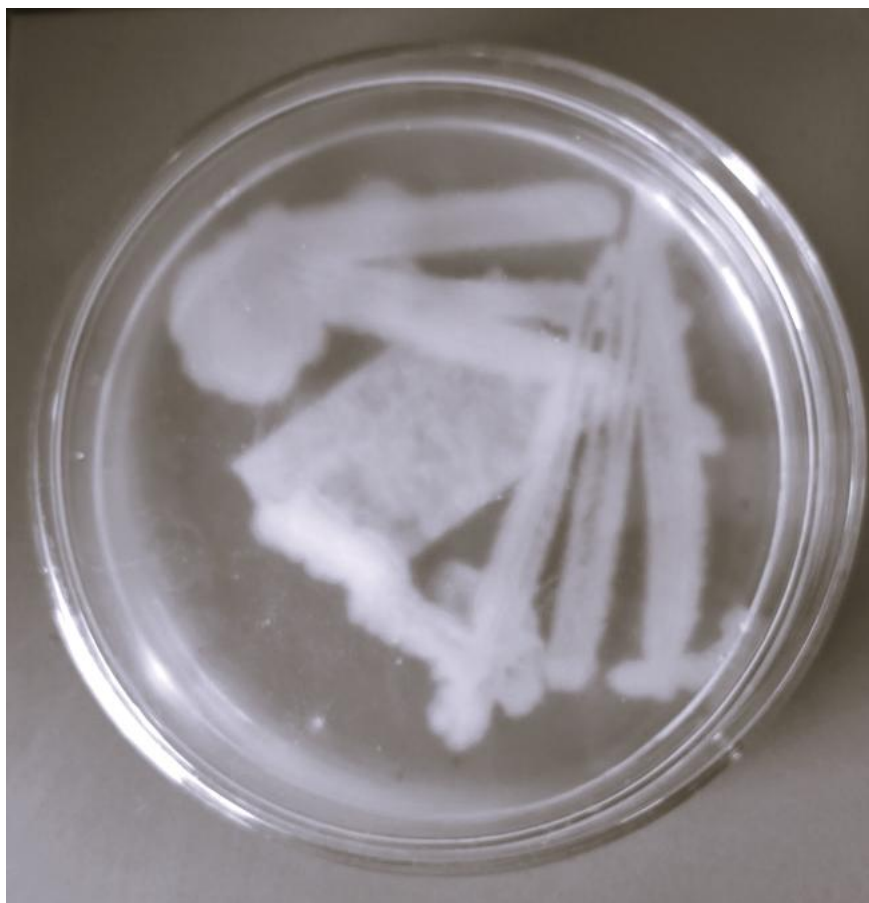
Figure 1: Morphological characteristics of Bacillus subtilis subsp. subtilis 168 in nutrient agar medium on 24-hour incubation.