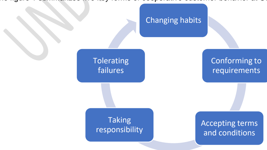
Figure 1: Elements of customer cooperation with SSTs.

The figure 1 summarizes five key forms of cooperative customer behavior at SSTs.