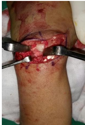
Picture 2. Superficial and deep dissection