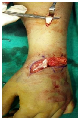
Picture 4. ECRL Tendon exposed