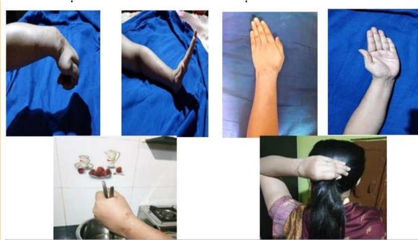
Figure 1 Range of movements recovery

Immediate post operatively below elbow cast was given and suture removal was done after 1.5 months. Patients clinical function was assessed using grip strength, ROM of wrist and VAS score (visual analogue scale). On 12 months follow up - range of movements with functional activities pain free and VAS score improved from 9 to 1.