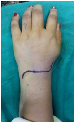
Picture 1 Incision over dorsal aspect