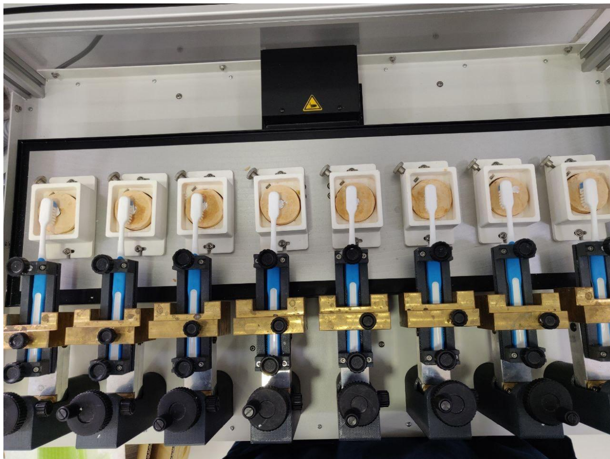
Figure 2: Samples before they underwent brushing simulation