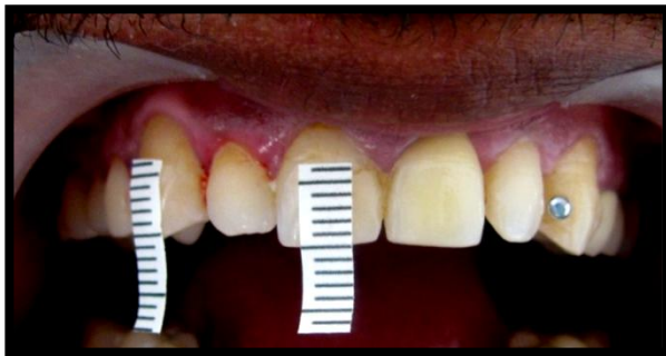
Fig 2 Sticking the adhesive tape with millimeter markings on labial surface of the right central incisor. The centimeter marking line correlated at the level of incisal edge of maxillary central incisor & the tip of maxillary canine