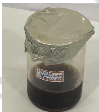
Figure 1: Cassia auriculata ethanolic extract