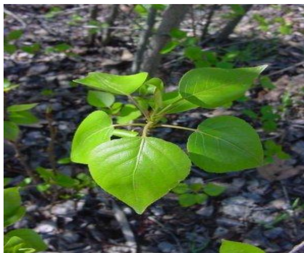
Fig.4 Populus trichocarpa

It thrives in light, medium and heavy soils, preferring well-drained soil but capable of growing in thick clay. Acid, neutral, and basic (alkaline) soils are all suitable, and they can even grow in highly acidic soils. It is unable to thrive in the shade 15 . The internal bark is mucilaginous and extraordinarily sweet, but unlike inner barks it ferments and sours easily thus cannot be dried to be used in winters but can be dried under sunlight for immediate use 16 .