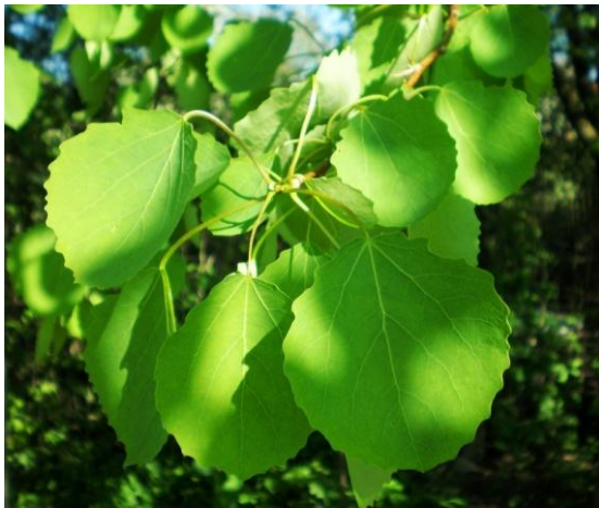
Fig.1 Populus tree

non-pharmacopoeial, and synthetic medications. We can't get away from nature since we are part of it. They must be promoted to preserve human lives 1 . This study aims to review the current knowledge on Populus trichocarpa biological investigations and therapeutic benefits. Populus trichocarpa considered as the first tree whose entire DNA code is decoded. The genome sequence of P. trichocarpa is a significant tool for employing comparative mapping to investigate the structure and function of genomes in the poplar and related species 2 .