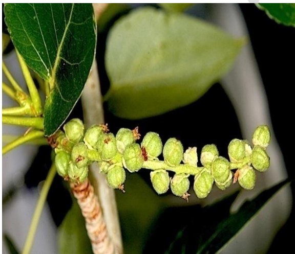
Fig.3 Cottonwood poplars

There is no calyx or corolla on the female flower, which consists of a single cell ovary situated in a cup-shaped disc. The style is short having 2–4 stigmas that are lobed in diverse ways and a large number of ovules 11 . Wind pollinates the plants, and the female catkins lengthen significantly between pollination and maturity. The fruit is either two or four-valved green to a reddish-brown capsule that matures in the middle of summer. It has a lot of small light brown seeds that are encircled by tufts of long, soft white hairs that help with wind dissemination 12 .