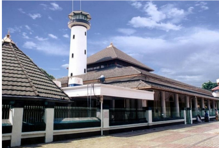
Fig. 2 The original building of the Ampel Mosque.

Figure 3 shows the main hall of the mosque with a frame construction made of teak wood. This is due to the fact that teak wood is a local material which was easily and cheaply available when the mosque was built. It was also discovered that stable and strong construction protects the building against structural and architectural damage (No. C). This durability, however, needs to be supported by good maintenance management to preserve the original building of the mosque (ICOMOS 2003; Jasiczak et. al. 2017; Jonbi 2018). The safety and security associated with using the building (No. D) also need to be guaranteed by applying non-hazardous construction, materials, and building designs as well as the availability of appropriate facilities in the building (Sedayu, 2018; Losev et. al. 2019). Moreover, the aesthetics of the mosque building, both architectural and structural components, also need to be maintained (No. E). This is due to the ability of the security and safety supported by appropriate aesthetics to attract domestic and foreign tourists. It has been discovered that aesthetics is usually felt directly by visitors both physically and psychologically (Sutrisno et. al. 2019). Furthermore, the use of heritage buildings as tourism icons in an area has the ability to improve the social, economic, and environmental aspects (ICOMOS 2017; Li et. al 2021) which need to be considered in the maintenance process to ensure proper and sustainable functioning of the structures.