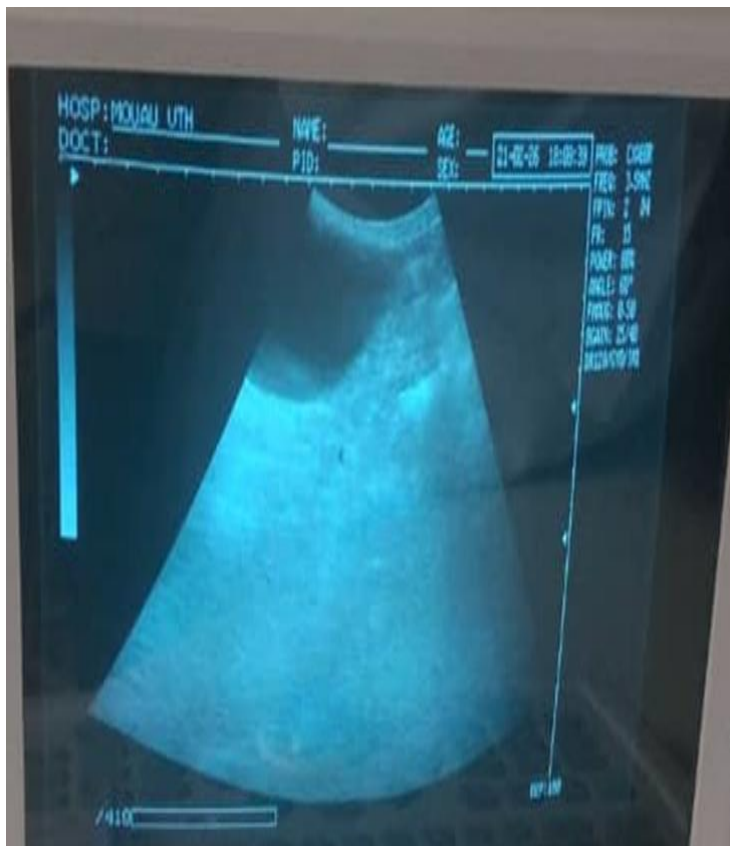
Figure 1: Ultrasonography of pseudopregnant uterus of the bitch