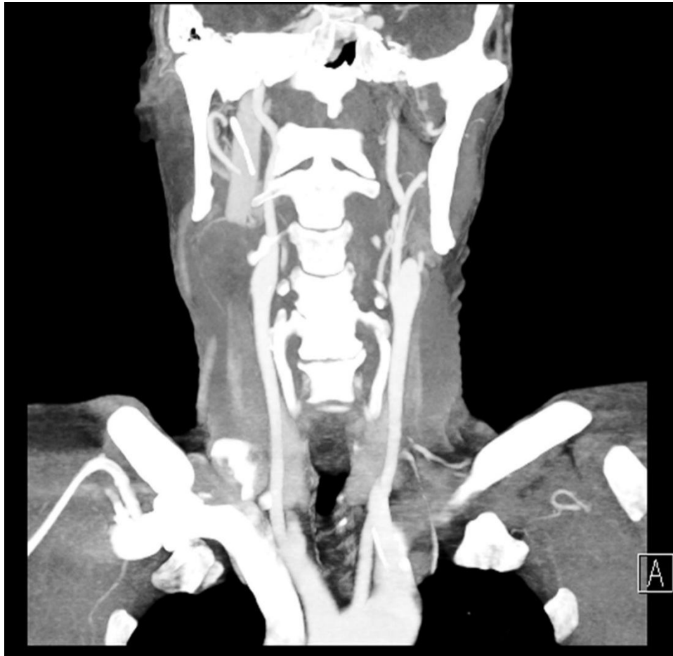
Fig A Coronal contrast-enhanced computed tomography scan in neck.