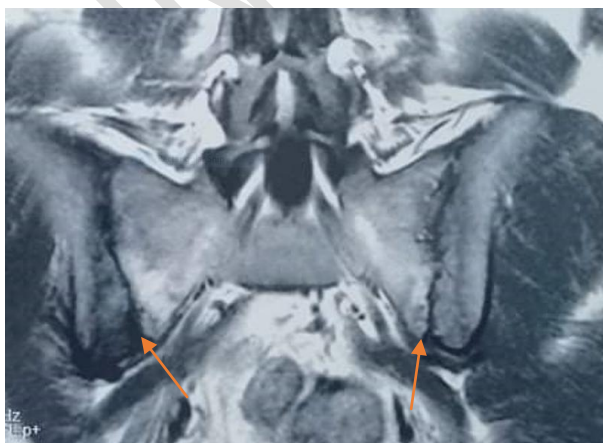
Figure 3: Sacroiliac joints MRI showing a bilateral active sacroiliitis (arrow)