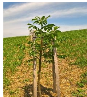
Figure 4 and 5 Walnut in I vegetation year