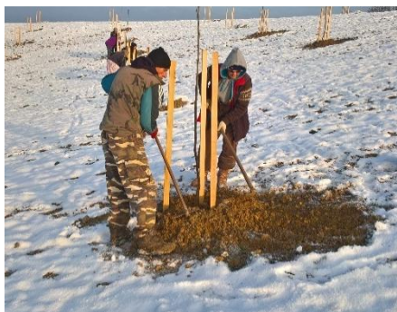
Figure 3 Time of planting walnut