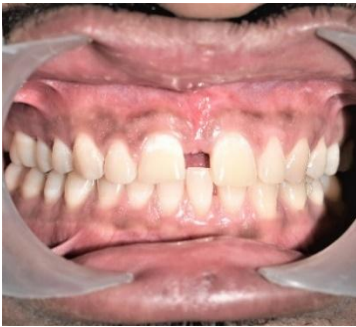
1 month follow up