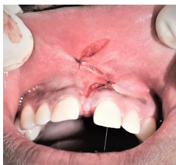
Tips of flap were sutured