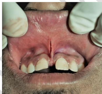
Initial vertical incision