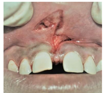
Z shape incisions