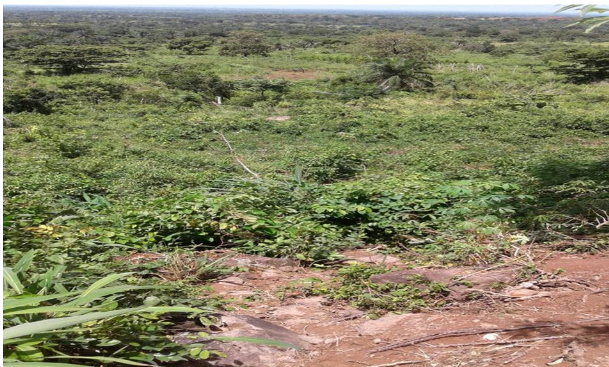
Fig. 4: Habitat and quadrat study of plant