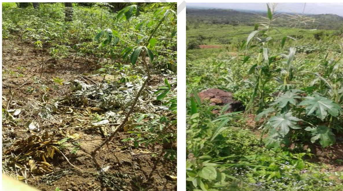
Fig. 2 : Morphology of plant species