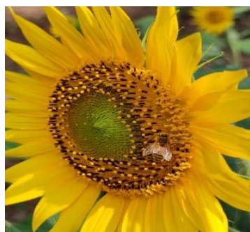
Apis cerana indica