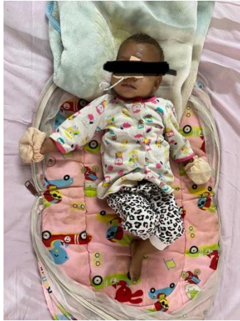
Figure 1 Patient suffering from ITS

The patient Developmental History shows as: