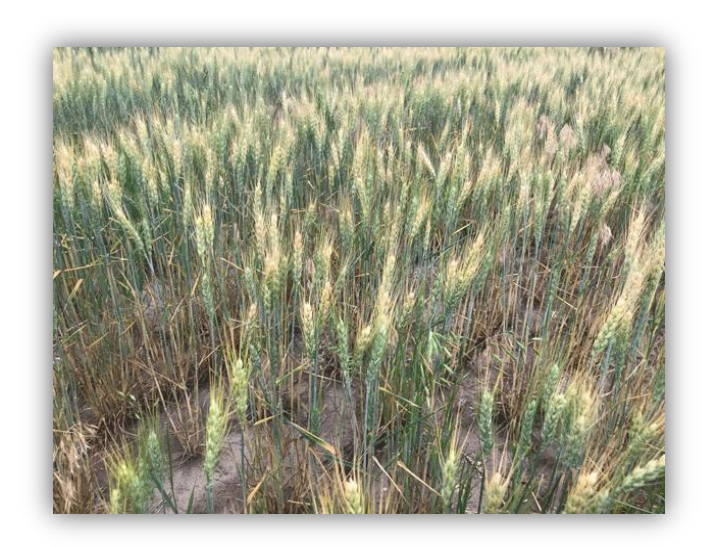
Figure1. Symptoms of terminal heat stress on wheat

reducing yield. The optimal temperature for grain setting and grain filling in wheat is between 19 °C and 22 °C (Porter and Gawith 1999). According to Hurkman et al. (2009), heat stress (37/28°C day/night) for a period of 10 to 20 days after anthesis till maturity lowers grain filling length and maturity; fresh and dry weight, proteins, and carbohydrate contents in grain drastically reduce grain size and yield. Wheat plants in Figure 1. are displaying indications of terminal heat and water stress due to a lack of water. Due to heat stress, the awns and higher heads are going white/chaff colored, while the lower stems are turning yellow straw-colored due to water stress.