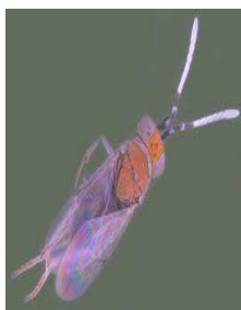
ii) P. Mexicana