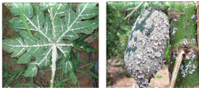
Plate 4. Nymphs and adult of P. marginatus on papaya fruit and leaf

Economic loss: Nearly 576 ha of papaya in Coimbatore districts had been affected. There are 60 plant species as hosts for Papaya mealybug, the pest has spread to almost all ecological niches in India through the transport of infested papaya fruits. Fortunately, the pest had been successfully managed through the intervention of classical biological control wherein Anagyrus loecki , Pseudleptomastix mexicana and Acerophagus papaya were imported from the USA (Plate 5). Predators like Cryptolaemus montrouzieri , lacewings, hoverflies and Scymnus sp. also play an essential role in managing this pest in the cotton ecosystem [10].