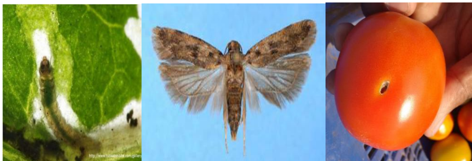
Plate 7. Leaf mining by Tuta absoluta larva

Nature of Damage: After hatching, young larvae of T. absoluta immediately mined into tomato leaves, apical buds, stalks, or fruits. Feeding resulted in inconspicuous mines (blotches), galleries on leaves, and pinhole-sized holes on fruits from the stalk end generally covered with frass. Larvae mainly attacked leaves, creating blotch/leaf mines visible from both leaf sides. The mines have dark frass visible inside, and the mined areas turned brown and dried over time.