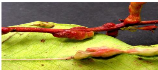
Plate 1. Galls produced by L. invasa on the leaf midribs

Damage: L. invasa lays eggs in the bark of shoots or the midribs of leaves. The eggs develop into minute, white, legless larvae within the host plant. Damage is caused when the developing larvae produce galls on the leaf midribs, petioles, and twigs (Plate 1). The galls can cause the twigs to split, destroying the cambium. Small circular holes indicating exit points of adults from pupae are common on the galls. Repeated attacks lead to loss of growth and vigor in susceptible trees. Severely attacked trees show gnarled appearance, stunted growth, lodging, dieback, and eventually tree death [6].