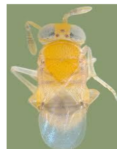
iii) A. papaya