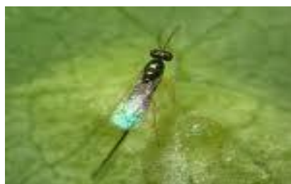
Plate 3. Aprostocetus gala on EGW

There is no severe incidence in Kolar, Mandya, and Ramnagar has been reported because promising parasitoid like Aprostocetus gala (Plate 3) was recorded with 7 to 15 percent parasitization [7].