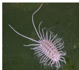
Plate 8: i) P. jackbeardsleyi (Ventral view)