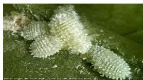
Plate 10: Lantana mealybug

It is native to South America and spreaded in Africa, tropical Pacific region of Australia, Southern Asia and China. It was first reported from India in Bangalore on China Aster Callistephus chinensis [25]. It is a pest of more than 50 species of host plant belonging to 26 families. It is also a promising biocontrol agent for Lantana camera in Queensland and Australia.