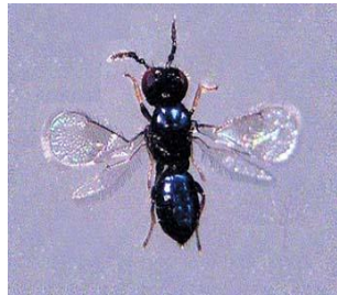
Plate 6 i) Asecodes hispinarum