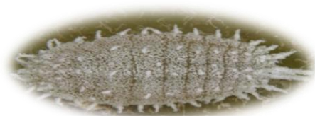
Plate 9:- Madeira mealybug

Host Plants: Cotton, tomato, potato, brinjal, tapioca, mulberry, acalypha, Hibiscus rosasinensis , Lantana camera and Clerodendron viscosum