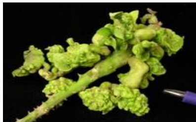
Plate 2. Swollen shoots of Erythrina

There is no severe incidence in Kolar, Mandya, and Ramnagar has been reported because promising parasitoid like Aprostocetus gala (Plate 3) was recorded with 7 to 15 percent parasitization [7].