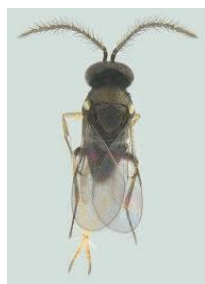
Plate 5 i) Anagyrus loecki

Economic loss: Nearly 576 ha of papaya in Coimbatore districts had been affected. There are 60 plant species as hosts for Papaya mealybug, the pest has spread to almost all ecological niches in India through the transport of infested papaya fruits. Fortunately, the pest had been successfully managed through the intervention of classical biological control wherein Anagyrus loecki , Pseudleptomastix mexicana and Acerophagus papaya were imported from the USA (Plate 5). Predators like Cryptolaemus montrouzieri , lacewings, hoverflies and Scymnus sp. also play an essential role in managing this pest in the cotton ecosystem [10].