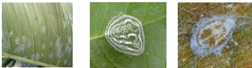
Fig 11: Damage

Host Plants: Coconut, banana, apple and several ornamental crops. Coconut and banana are the most common and preferred hosts. More minor infestations were seen on guava, citrus, mango, sapota, okra, custard apple, jatropha, and hibiscus [28].