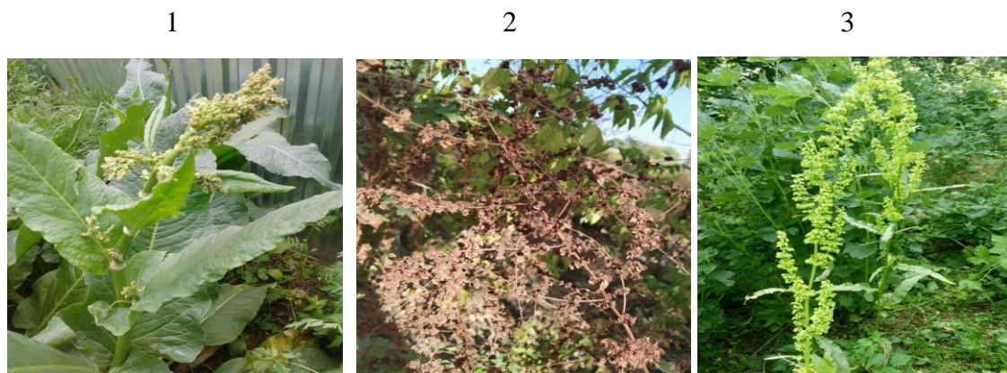
Figure 1. R. pamiricus Rech. f. (1); R. confertus Willd. (2); R. conglomeratus Murray (3). Location: Beldersay, Chimgan mountains (Ugam Chatkal National Park), Tashkent region. (Pictures author: G.D.Shermatova).

real advantage among wild plants of the temperate zone. It should also be noted that Rumex species have a high potential for regrowth after injury” [14].