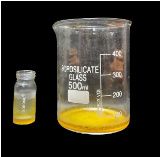
Fig 1. Concrete obtained through solvent extraction