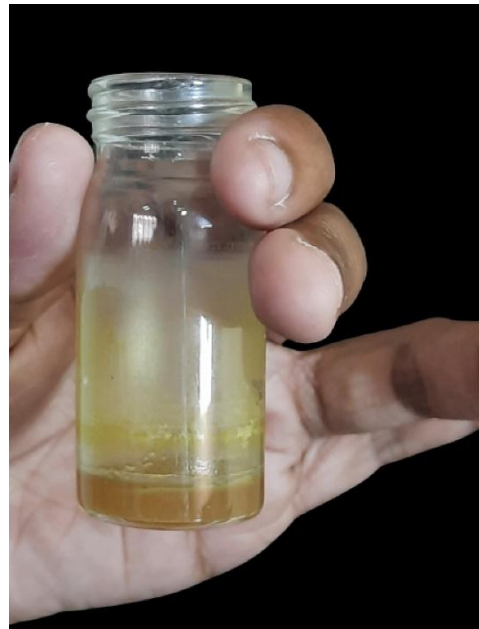
Fig. 2. Evaporation of hexane