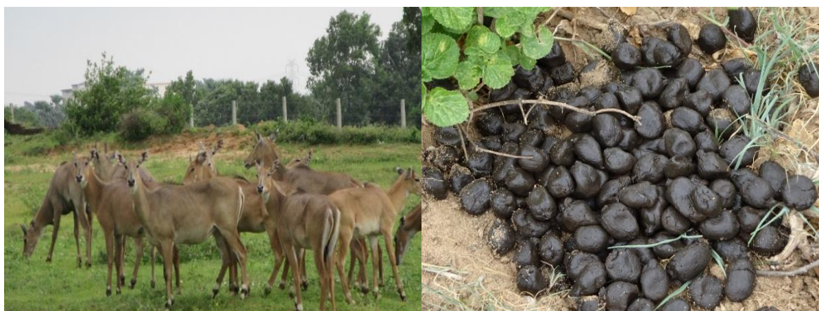
Fig.2. Herd of females and juveniles nilgai and their faecal pellets

and downpour and these areas also distinguish by utmost high and low temperature drip down to 4 °C during winter [21,24] . They survived in this exciting condition and breed continually. In captivity, nilgai can drink up to 14 L of water per day when temperature reach 40 °C [25] . Nilgai live in herds females and juveniles are always together, they graze and sit together in a group in gregarious form thus females are docile in temperament and its exhibited social bond. They also graze with domestic animals, so making them easy for human to control Fig-2, [3] .