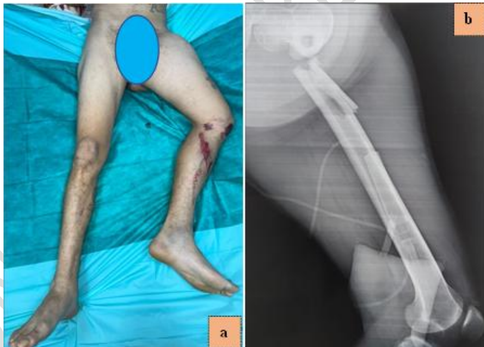
Fig. 1. a: Vicious attitude of the left lower limb with ecchymosis of the front of the knee, shortening of the limb. b: lateral view of the left femur showed the complex femoral shaft fracture with rotation of the proximal parts.