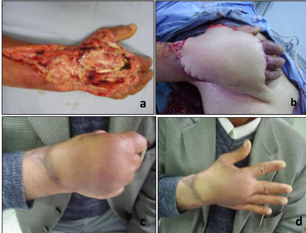
Figure 1 : dorsal defect of the right hand and wrist after excision of necrotizing fascitis in a diabetic patient, covered by a Mc Gregor flap with an excellent functional outcome.

A soaping effect of the flap in 3 cases of volar loss of substance of the hand.