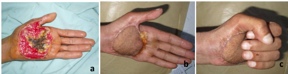
Figure 2 : coverage of a volar skin defect of the hand. Inesthetic and dyschromic aspect of the flap despite a good functional result.