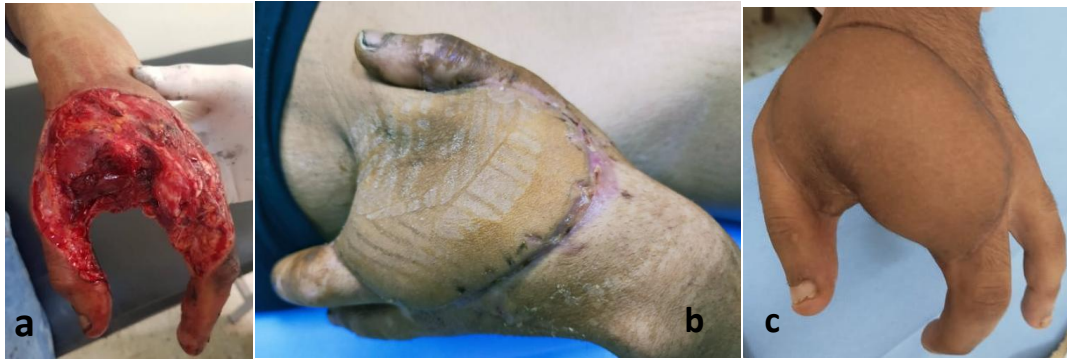
Figure 5 : reconstruction of first web space of left hand after a traumatic amputation of index and middle finger. Good aesthetic result.