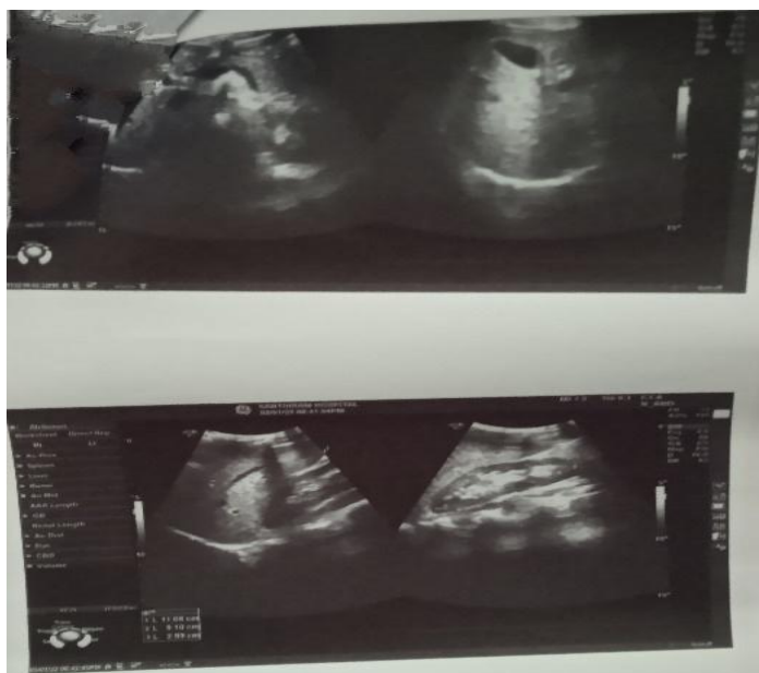
Fig.2 Ultrasound scan of abdomen