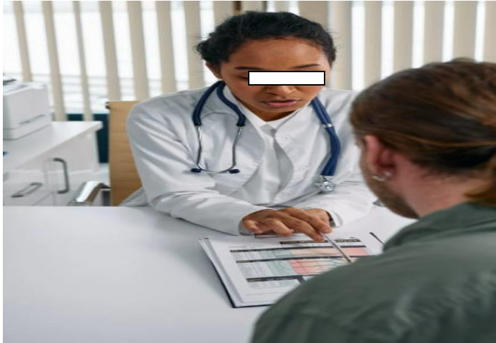
Fig.No.7. In-depth Patient Interview and Counselling.