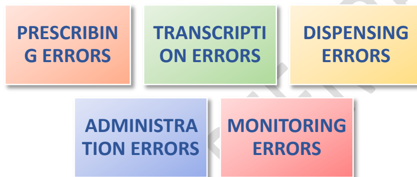
Fig No.1. Types of Medication errors.