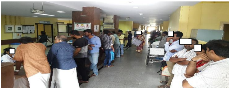
Fig No. 5. Challenging patient populations.