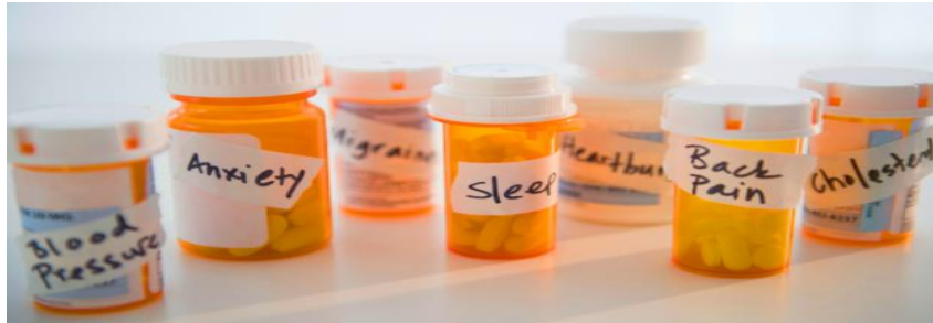
Fig No.3. Polypharmacy.