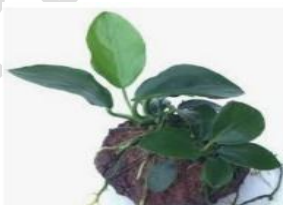
Plate 3. Anubias barteri

Baybay station exhibited 3 mangrove-epiphytic plants species namely Anubias barteri , Microsorium pteropus and Asplenium midus . The most common species that can be found in all plots was Anubias barteri with relative abundance of 46%.