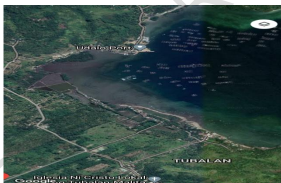
Figure 1. The Map of Tubalan Cove, Malita, Davao Occidental showing the location of the study sites ( www.google.com/map ).

The study was conducted in the identified mangrove rehabilitation sites of Davao Occidental, particularly Sitio Agdao of Brgy. Tubalan, Sitio Baybay of Brgy. Buhangin and Sitio Lahusan of Brgy. Fishing Village, Malita, Davao Occidental.