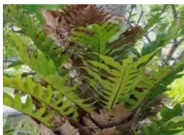
Plate 4. Aglaomorpha quercifold

Among 3 stations, Sitio Lahusan has the most numbered of mangrove-epiphytic plants with 4 species identified ( Imprerata cycindrica , Aglaomorpha quercifold , Microsorium pteropus , and Davalia denticulata ). Of these mentioned species, Aglaomorpha quercifold still exhibited as the most abundant with 54%. In this station, the species of Imprerata cycindrica can be noticed, in which this cannot be found in other 2 stations.