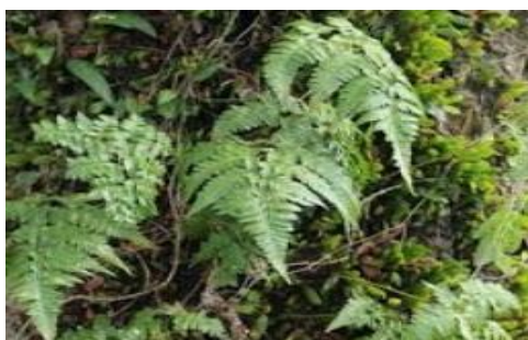
Plate 1. Davalia denticulata

Results of the study shows that species of mangrove epiphytes in the study area composed of 3 to 5 species per station and exhibit 1 to 3 identified species per plot. The species of Davalia denticulata and Aglaomorpha quercifold were the most common species of mangrove-epiphytic plants in the Agdao Station with relative abundance higher than 50% followed by Asplenium midus in 33.33%.