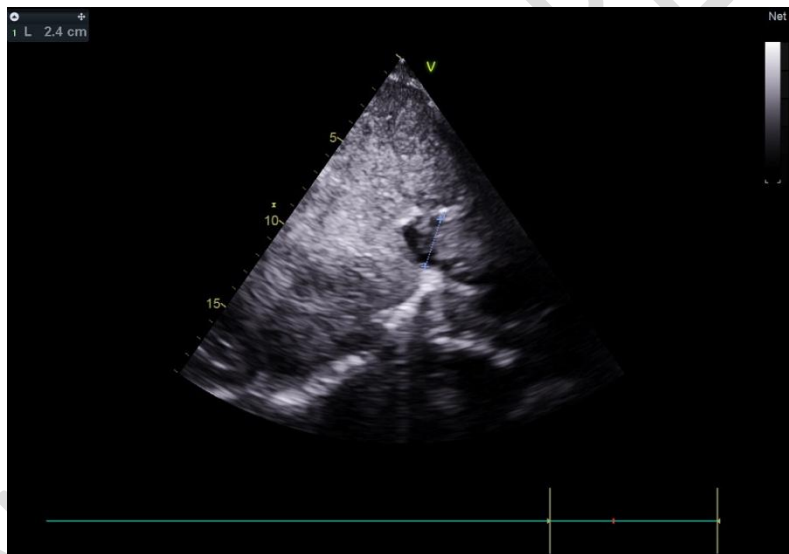
Figure 2: TTE showing the intra- Inferior Veina cava mass measuring 24mm