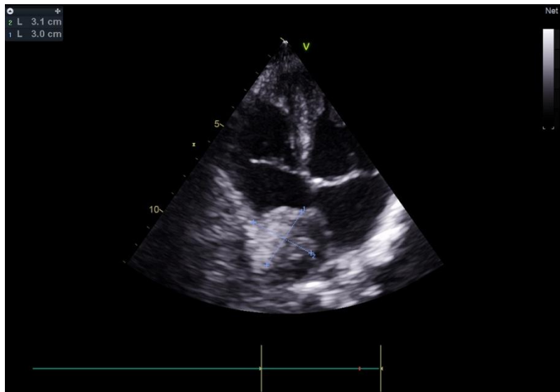
Figure 1: TTE showing a right intraauricular hyperechogenic mass measuring 31*30mm