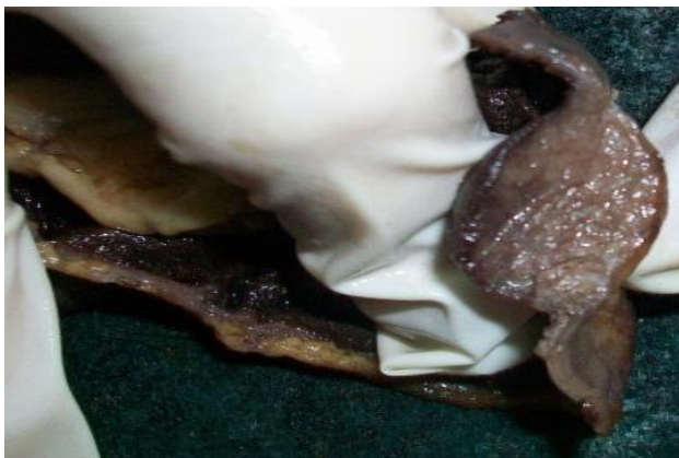
Fig 1. A round polypoid mass was noted proximal to the intussusception

A thorough inspection was done to look for a Meckel's diverticulum, which was not found. However, a round polypoid mass measuring (20x20x5.5mm) was noted proximal to the intussusception (Fig 1). On histopathology, ectopic pancreatic tissue was seen in the small bowel (Fig 2).