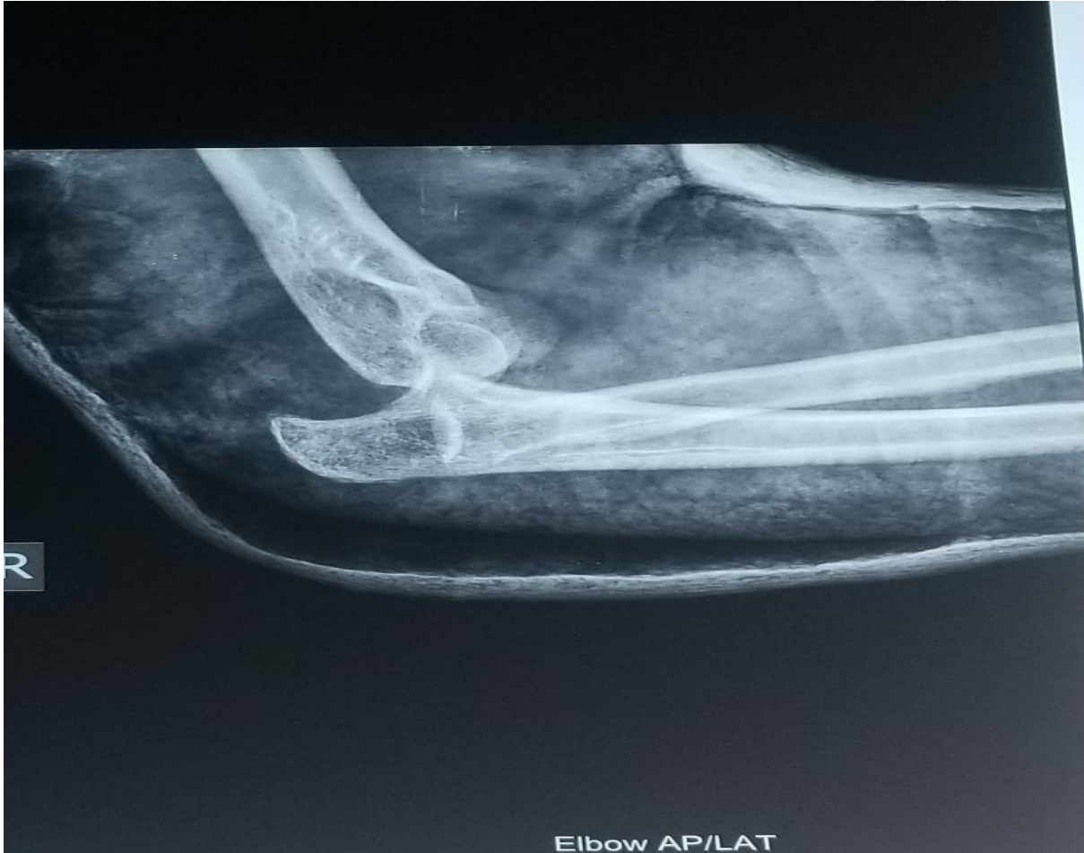
Fig 1: Anterior/Lateral view of the Right Elbow showing the dislocated elbow. The coronoid and olecranon processes are also visible.