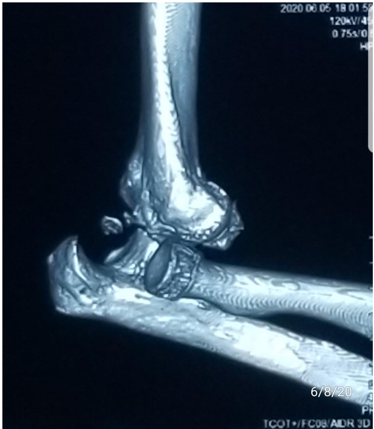
Fig 2. CT scan of Right Elbow showing the dislocated elbow