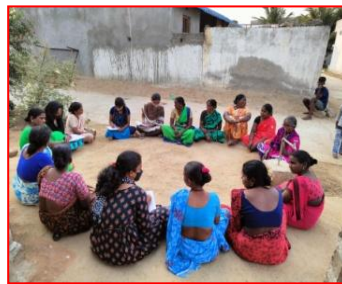
Image 2 b: Awareness on Food Adulteration