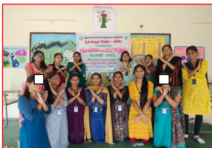
Image 2 d: International Women's Day