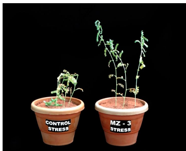
Figure 3: Thirty days old chickpea seedlings under drought stress conditions.