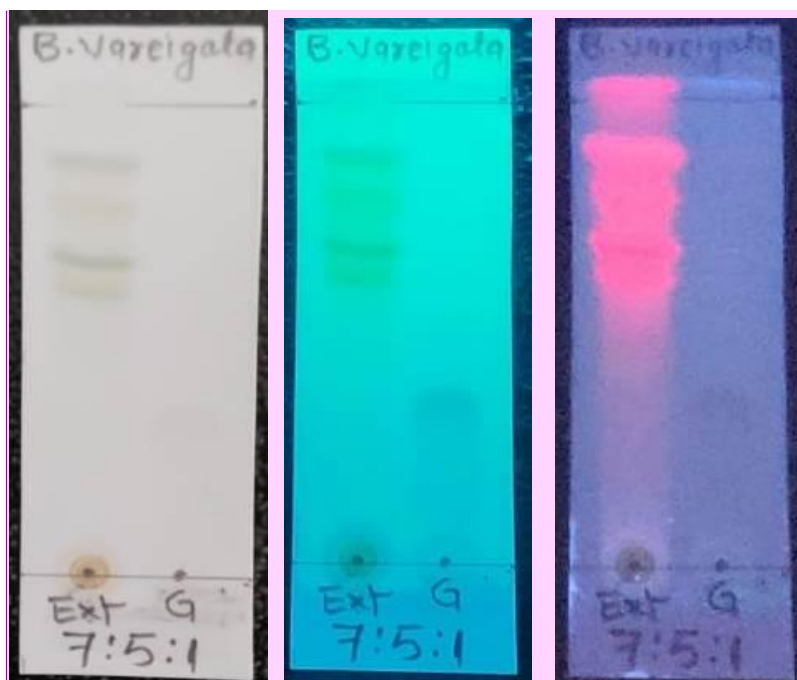
Figure 2: Normal Light