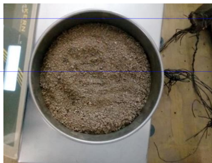
Figure 1 Waste paper sludge used for the study

Waste Paper Sludge (WPS) is a solid waste material collected from the Paper recycling industry. It is the end-product obtained from pulping and removing of impurities several times. Waste paper sludge used for this study is brown in color and has pH value of 8.75, which is slightly basic. Specific gravity of Waste paper sludge is 2.3.