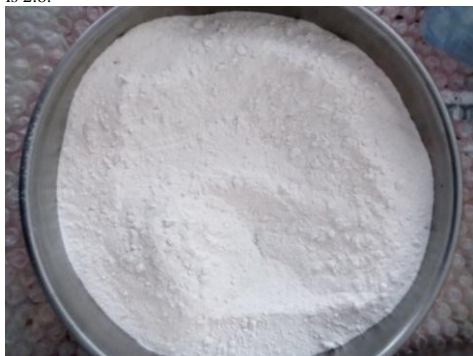
Figure 2 Marble dust used for the study

value of 10.1, which is slightly basic. Specific gravity of marble dust is 2.8.