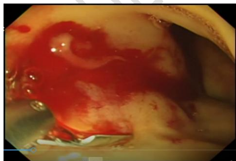
Figure 3a: A bleeding visible vessel in a duodenal bulb ulcer