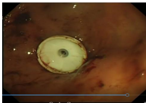
Figure 2: Internal bolster of a PEG tube in situ