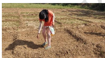
Fig 2. 20x10 cm line Sowing