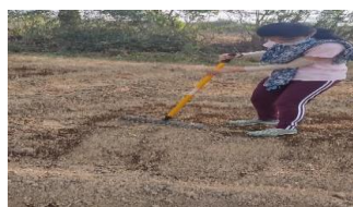
Fig 1. Mixing vermicompost