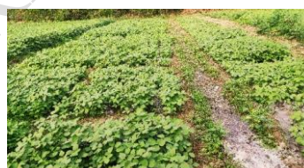
Fig 3. Irrigation 35DAS at flowering

Comment [JM33]: These figures should be indicated in the text. Please, read the author's guide.