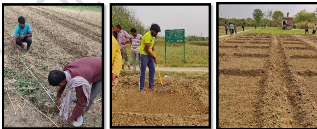
Fig.2. The layout of the experimental field, Tilling the research plots through rake and leveling the plots through leveler at Crop Research Farm, Department of Agronomy, SHUATS, Prayagraj during Zaid , 2021.