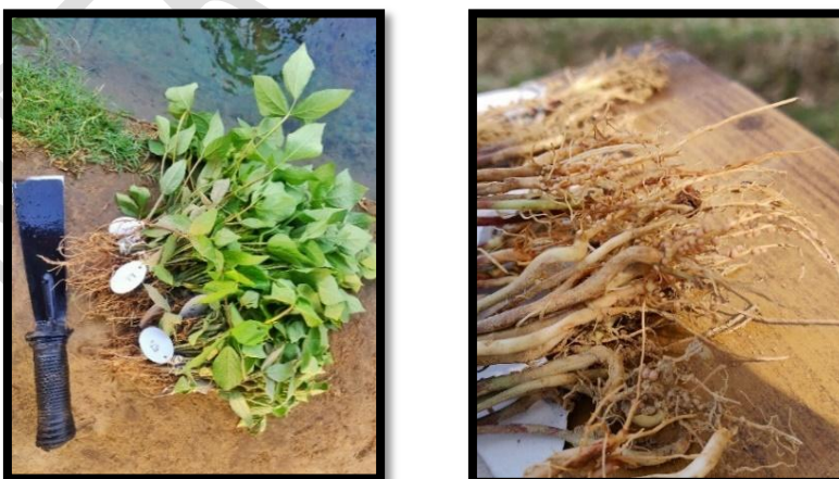
Fig.5. Black gram plant samples were uprooted at 40DAS for observation of dry matter accumulation and several nodules count.