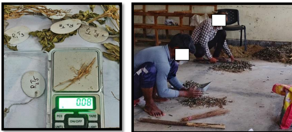
Fig.6. Black gram root dry weight was taken off accordingly and the Threshing of matured pods from the 1m 2 area had kept separately.