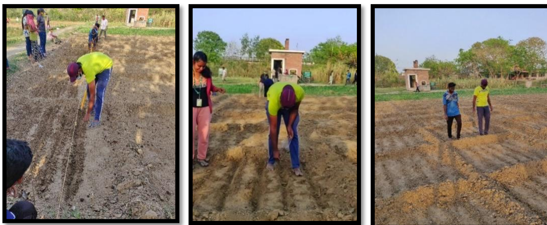
Fig.3. The line sowing method was carried out manually for the sowing of black gram seeds at Crop Research Farm, Department of Agronomy, SHUATS, Prayagraj during Zaid , 2021.