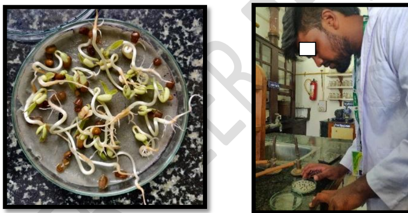
Fig.1. Germination test of black gram was done in the laboratory of the Department of Agronomy, SHUATS, Prayagraj.