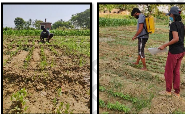
Fig.4. Weeding, thinning, and Foliar application of G. Sap (15DAS) was done manually at Crop Research Farm, Department of Agronomy, SHUATS, Prayagraj during Zaid , 2021.