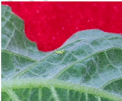
Plate 2. Major sucking insect pests observed in sunflower crop during the study