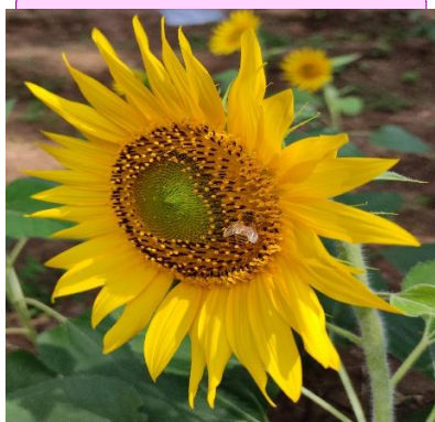
Apis cerana indica