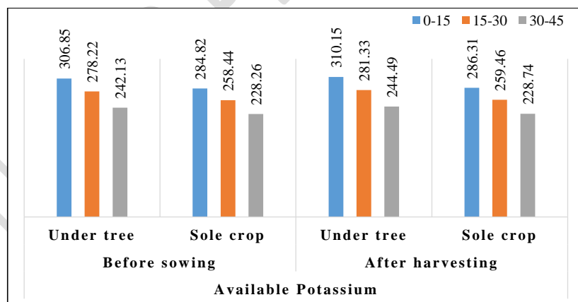
Fig. 2: Available potassium status ( \text{kg ha}^{-1} ) at different depths under poplar based agroforestry and sole barley

The N, P and K content (%) in grain and straw of different barley varieties grown under poplar-based