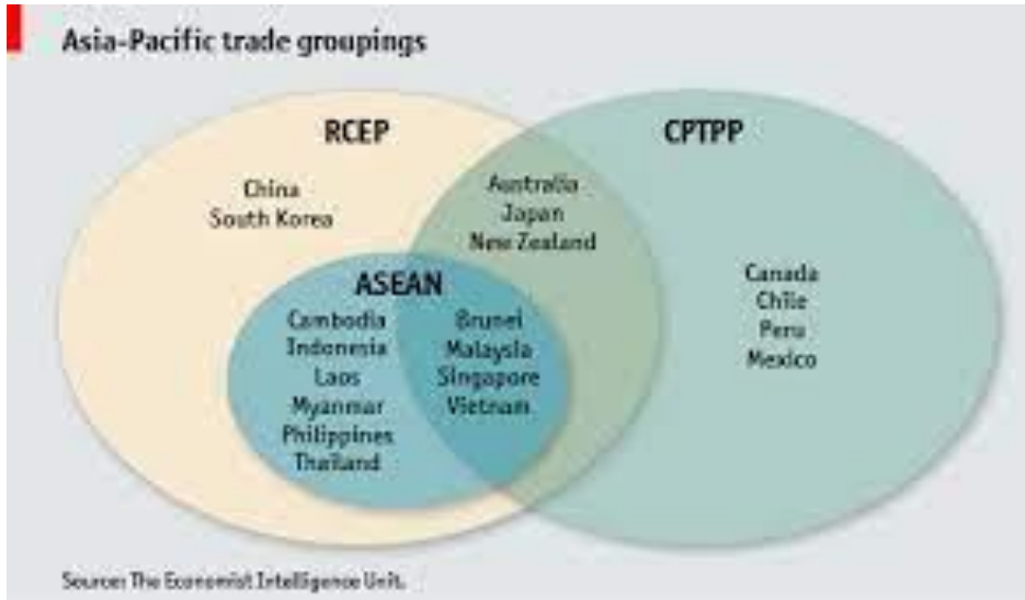
Figure 1 : Asia-Pacific Trade Groupings