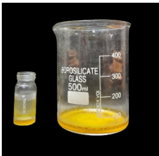
Fig 1. Concrete obtained through solvent extraction