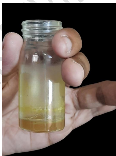
Fig. 2. Evaporation of hexane