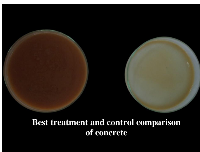
Fig. 3. Comparison of the concrete of the T1 and T6