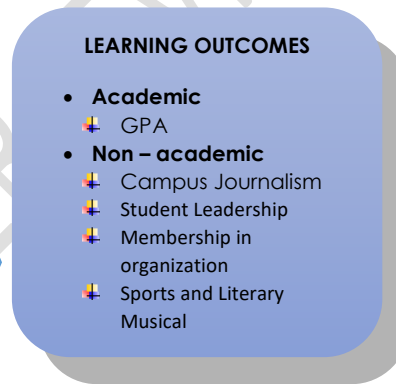
Figure 1. The Schematic presentation of the study.