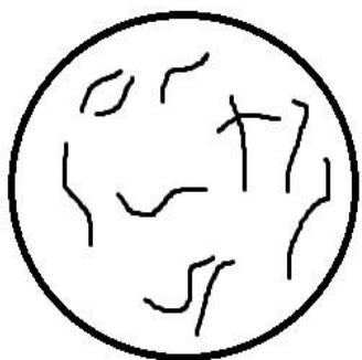
FIGURE 1: MYCOBACTERIUM TUBERCULOSIS

system of the individual is impaired, resulting in infection. Depending on the individual, active tuberculosis disease might occur soon after infection or take a long time to develop. Excessive coughing, chest pain, weight loss, fever, and exhaustion are all signs of active tuberculosis. People with active tuberculosis are contagious because they can spread the bacterium to others. [1]