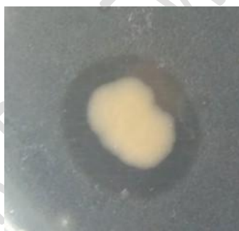
Figure 3. Proteolytic Test Results

amino acids. The clear zone is an indicator that bacterial isolates can utilize casein in the media as a source of nutrition (19).