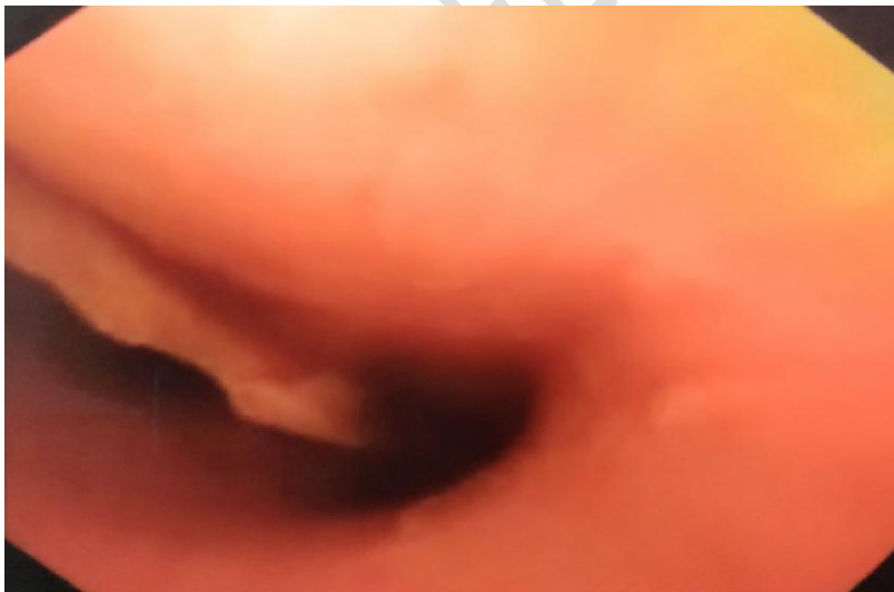
Fig. 3. Right bronchus following removal of foreign body. Chicken bone was removed