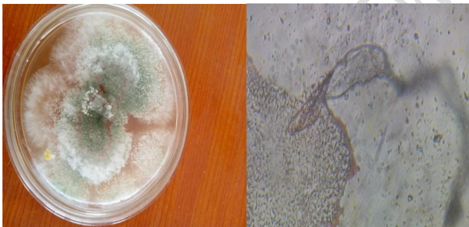
Plate Ia: Pure culture of A. flavus

Four fungal pathogens ( Aspergillus niger , Aspergillus flavus , Penicillium expansum and Rhizopus stolonifer ) were isolated and confirmed through pathogenicity test to be responsible for sweet orange fruit rot in the markets (plate i-iv).