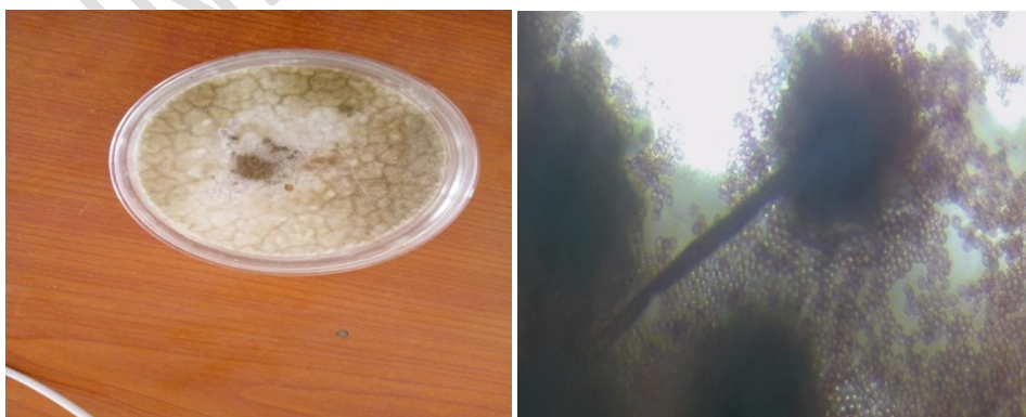
Plate Ib: Photomicrograph of A. flavus