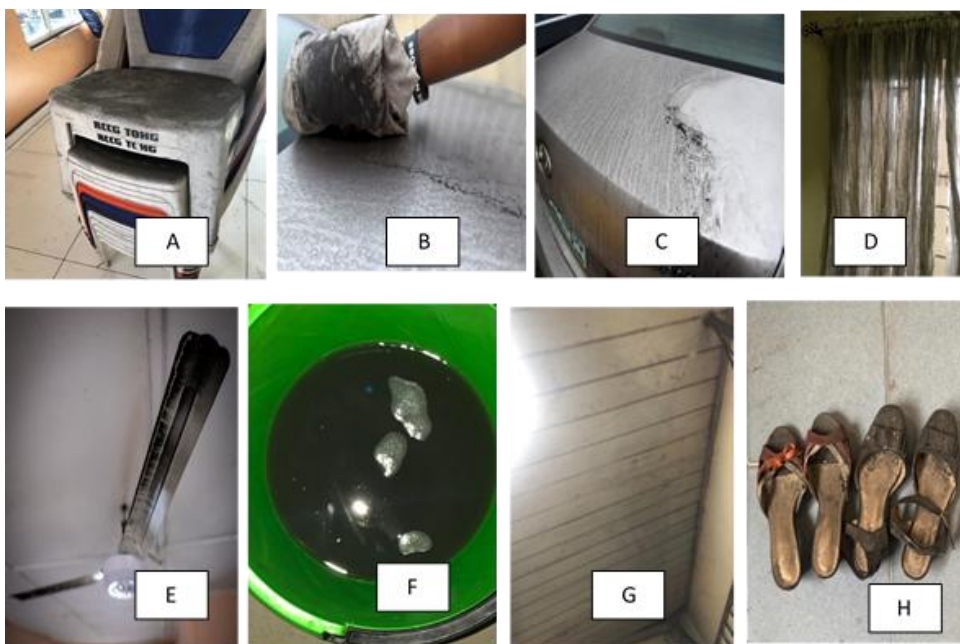
Figure 1 – Add caption. Plate (A-H): .....

In recent years, several studies have been carried out to assess the levels of air pollutants, people's awareness, possible solutions and impact on human health and the environment in different part of the world including Port Harcourt. Majority of these studies have found a possible association with air borne diseases, provide evidence on poor air quality which has exceeded the above national and international regulatory-recommended levels of ambient air pollutants [5–9]. Studies have also been carried out in the Niger delta to determine the relationship between Particulate Matter (PM2.5) concentration and the incident of Respiratory Tract Infections (RTIs). Findings reveal that for Port-Harcourt, there were significant variation in the occurrence of PM2.5 and the mean monthly variation (2016-2019) showed that Port Harcourt had 47.27 \mu\text{g}/\text{m}^3 for January, which is far above the World health organization approved limit of 10 \mu\text{g}/\text{m}^3 . Thereby aggravating Respiratory Tract Infections