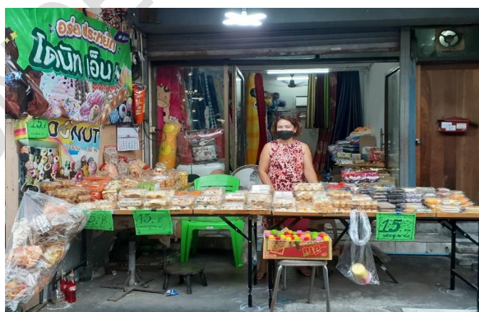
Fig. 2. Street Food Vendor selling packaged food during Covid-19