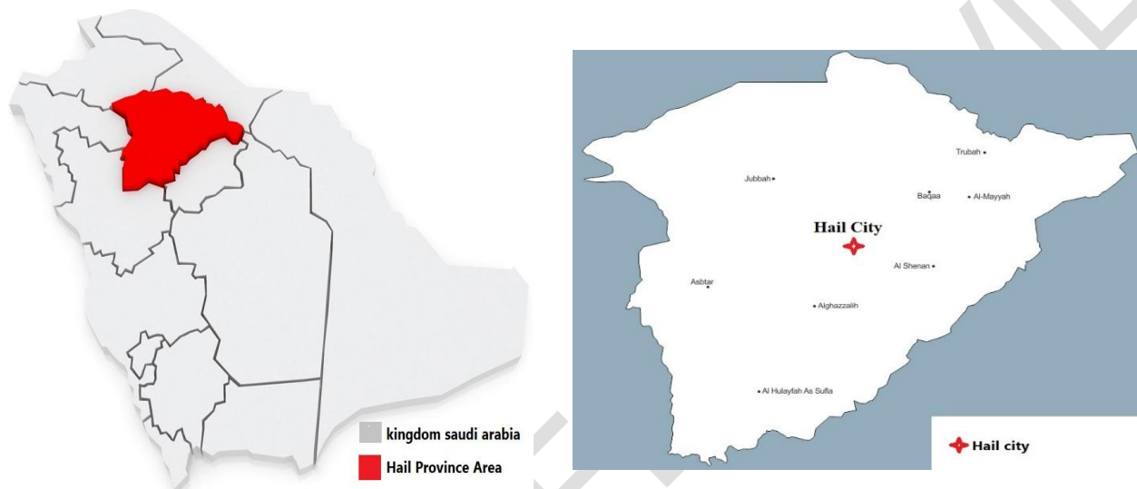
Fig. 1. A geographic map showing Hail province area involved in the study.

The current study is a retrospective analysis of 300 in-and outpatient stool sample reports for intestinal parasite diseases from the King Khaled hospitals in Hail, Saudi Arabia, between 2018 and 2021. Hail is situated in the northwest region of Saudi Arabia (27.3 N., 41.E) and has a continental desert climate with hot summers and mild winters. Hail is located at a high elevation (1,140 meters above mean sea level) and receives a yearly rainfall of 100.6 millimeters [figure 1]. Study participants included Saudi and non-Saudi patients at King Salman General Hospital.