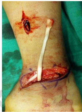
Picture 5. Harvested ECRL Tendon