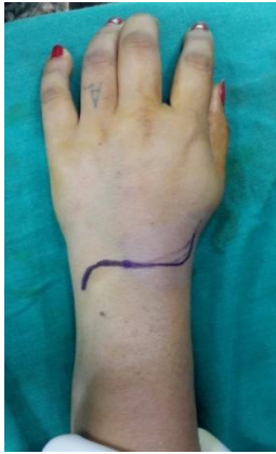
Picture 1. Incision over dorsal aspect