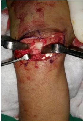
Picture 2. Superficial and deep dissection